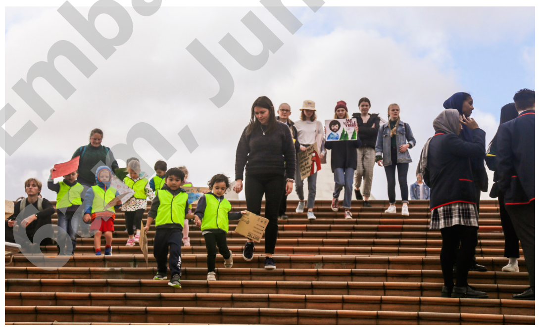
Children paticipating in climate strikes in 2019