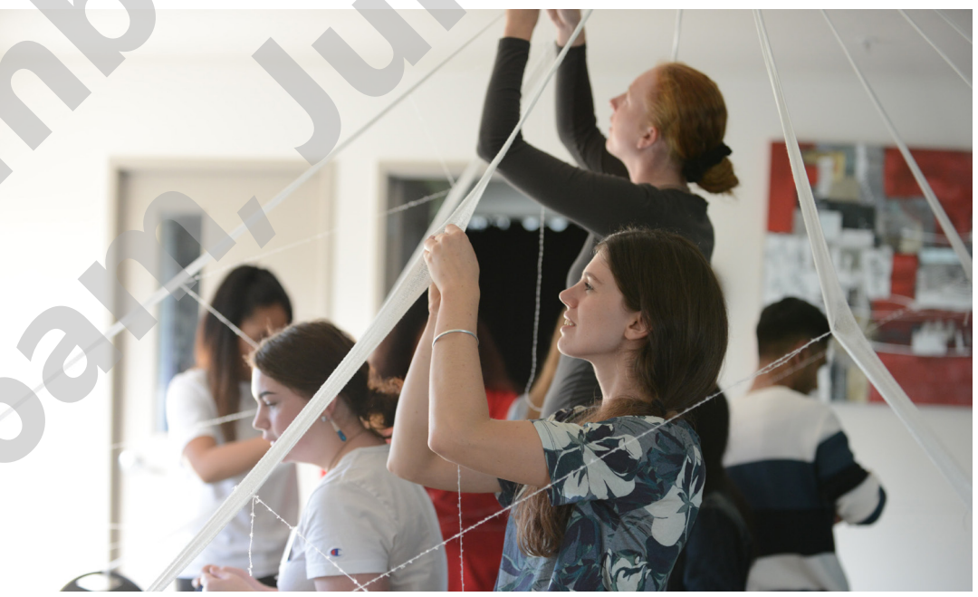
Young people preparing for the Race Unity Hui in 2019, in response to the 15 March terrorist attacks

The ten ideas that follow are based on reinforcing these three elements to improve children's participation in policy and legislative development in Aotearoa.