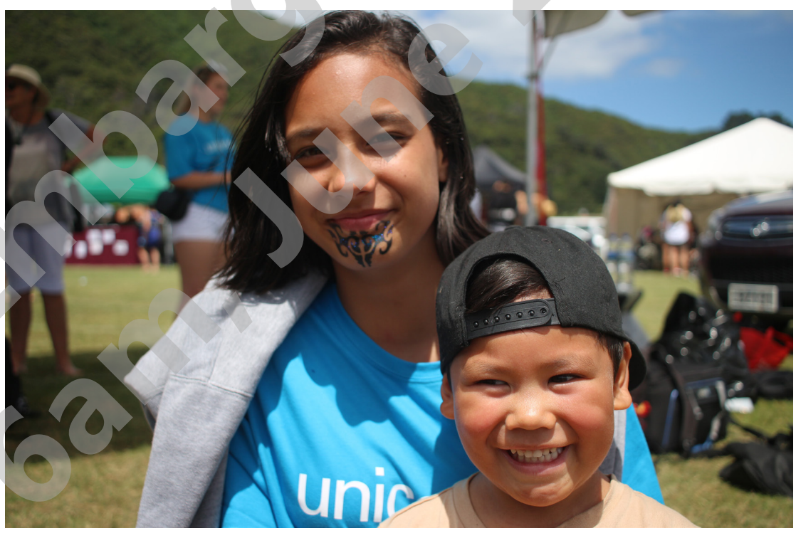
Tamariki participating in Te Ra festival

Better and more equal opportunities for tamariki Māori to participate in policy development are necessary, and there is a need to strengthen efforts to ensure that these opportunities take place in the context of whānau. There is also a need to better understand and frame how indigenous rights could lead to greater participation, rangatiratanga, non-discrimination and equality for tamariki Māori. Ensuring tamariki and rangatahi Māori are included in the consultation process for the plan of action for implementing UNDRIP is an upcoming opportunity.