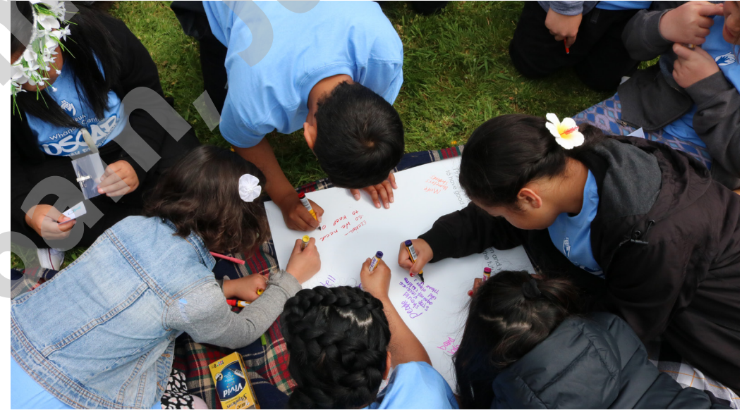
Children and young people giving their views for 'What Makes a Good Life?'

The Office of the Children's Commissioner is well placed to assist government agencies with how to facilitate seeking the views of children, and there are many resources available to support this (see appendix three).