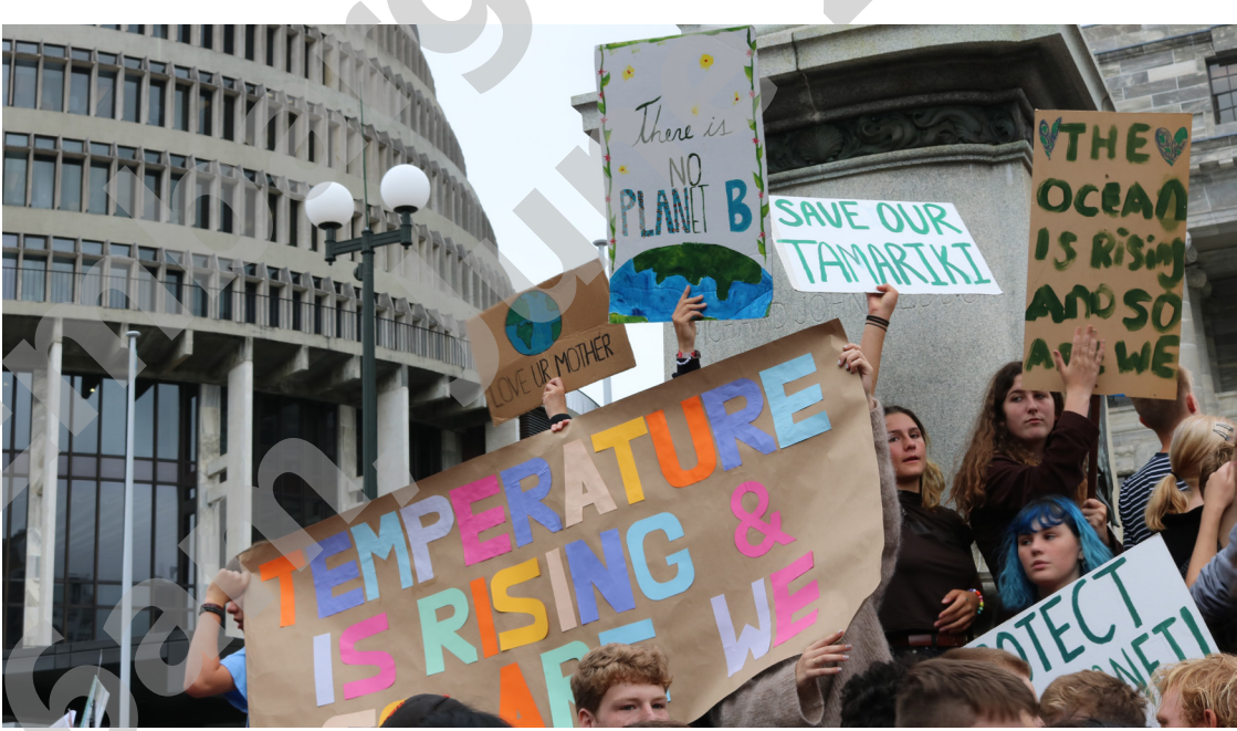
Children and young people protesting outside Parliament, 15 March 2019