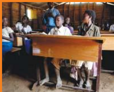
REWRITE THE FUTURE PAGE 6