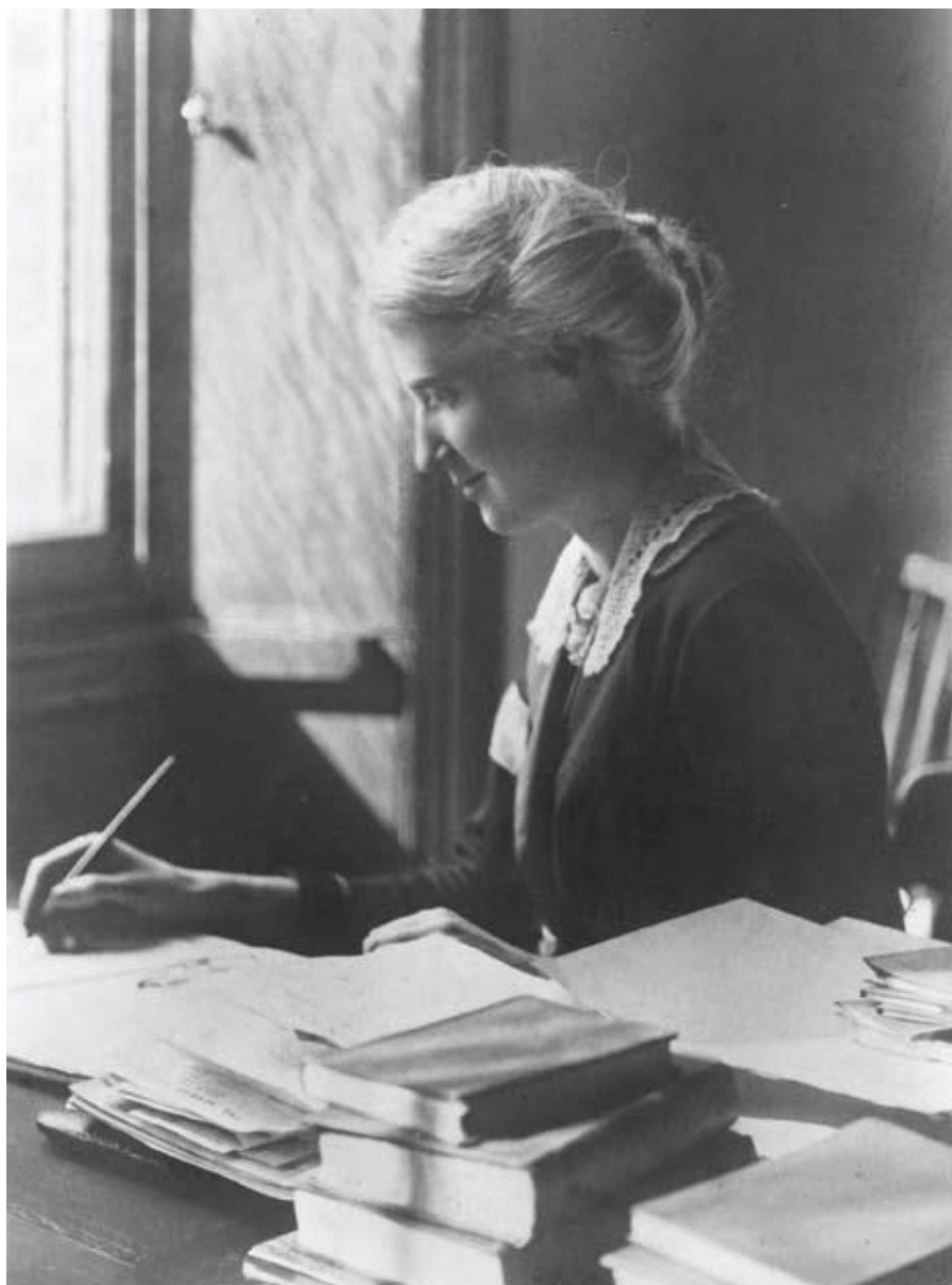
SAVE THE CHILDREN FOUNDER EGLANTYNE JEBB.

Save the Children is 90 years old this May but, while some of our methods have evolved and our global reach has grown dramatically, our vision has remained unchanged – to save the lives, improve the life chances, and protect the rights of children around the world.