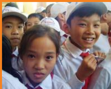
EVENTS PAGE 10