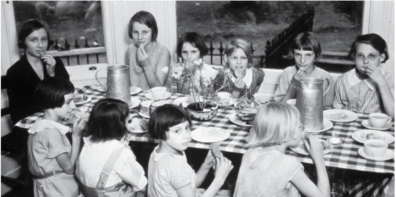
CHILDREN ENJOY A MEAL AT FAIRFIELD HOUSE, THE FIRST UK PROGRAMME SET UP IN 1927.

underfunded, working-class school, she discovered that not only was she a poor teacher, but she had no particular affection for children! Classes hung over her "like a thunderstorm" and taking lessons was like "being put on the rack".