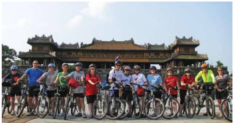
THE CYCLE CHALLENGE TEAM OUTSIDE THE KING'S PALACE IN HUE, VIETNAM.

The stigma attached to HIV and AIDS is often a barrier to treatment as people are afraid of the discrimination that may follow. Health and support services are available, but accessing these services and knowing what rights people have are limited. This is where Save the Children helps – by letting people know their rights and ways they can stand up for their rights.