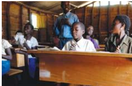
THE PUPILS ENROLLED IN THE ALP RUN BY SAVE THE CHILDREN, HAVE MISSED OUT ON THEIR PRIMARY EDUCATION BECAUSE OF THE CONFLICT. THE ALP ENABLES THE CHILDREN TO CATCH UP ON MISSED PRIMARY EDUCATION SO THAT THEY CAN THEN GO INTO THE MAINSTREAM EDUCATION SYSTEM.

What's more, we need governments to back up their promises that education can be provided to every child. There's plenty of money in the world, as we have seen by governments' reactions to the economic crisis, but we need to prioritise education. What's missing is the political will on behalf