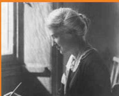
90TH ANNIVERSARY PAGE 8