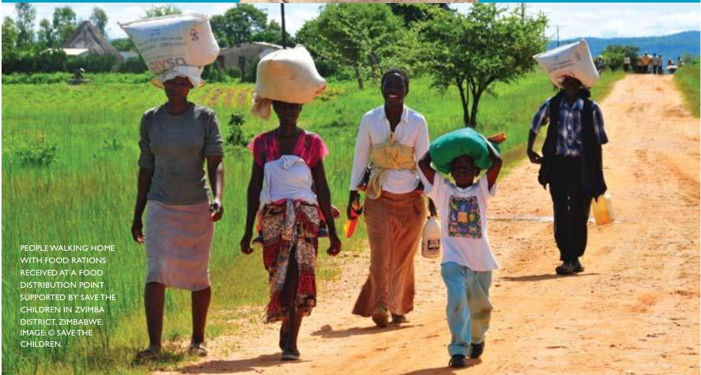
PEOPLE WALKING HOME WITH FOOD RATIONS RECEIVED AT A FOOD DISTRIBUTION POINT SUPPORTED BY SAVE THE CHILDREN IN ZIMBA DISTRICT, ZIMBABWE.