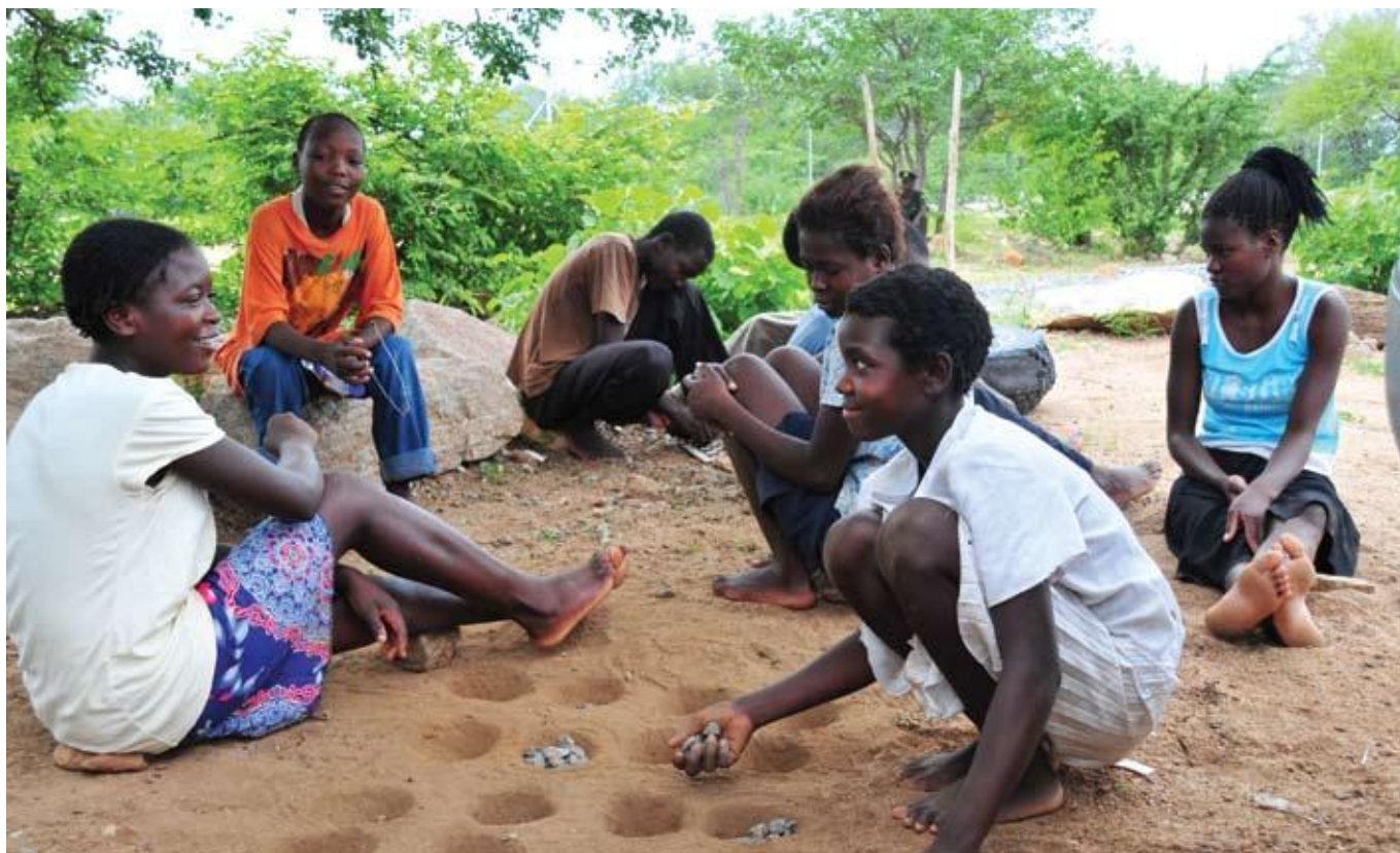
CHILDREN PLAY AT SAVE THE CHILDREN'S RECEPTION CENTRE FOR DEPORTED CHILDREN IN BEITBRIDGE, ZIMBABWE. THEY ARE SOME OF MANY ZIMBABWEAN ORPHANS TRYING TO FIND A BETTER LIFE IN SOUTH AFRICA. AT THE CENTRE, UNACCOMPANIED CHILDREN CAN GET COUNSELLING, INFORMATION ON HIV/AIDS AND SAFE MIGRATION – AS WELL AS THE CHANCE TO TALK AND DO ACTIVITIES WITH OTHER YOUNG PEOPLE AT THE CENTRE. WE ALSO HELP REUNITE THEM SAFELY WITH THEIR FAMILIES OR RELATIVES WHERE POSSIBLE.

As the number of emergencies increase, the number of children affected also increases. Children are the most vulnerable in any emergency and it is our job to make sure they have medical help, supplies like food and tarpaulins for shelter, and educational supplies so that they can continue their education.