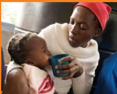
EMERGENCIES PAGE 4