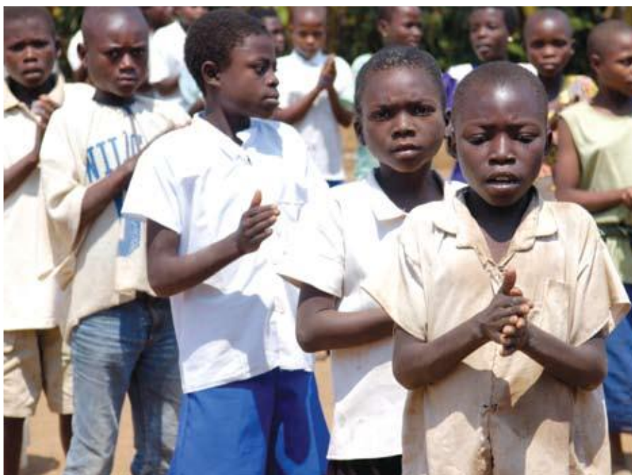
PUPILS SINGING AND DANCING DURING A BREAK FROM THE ACCELERATED LEARNING PROGRAMME (ALP) AT MULENGEZA ELEMENTARY SCHOOL IN DRC.

The current situation in the Democratic Republic of Congo shows how children can become trapped in a cycle of conflict. Can you imagine a child living in a country where conflict rages, who doesn't know how to read, who doesn't know how to write, has no skills to cope with life, has no hope, and the frustration that child would feel? Without education, children are also more vulnerable to exploitation and recruitment into armed groups. Without