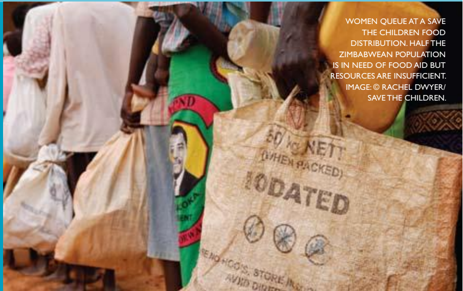
WOMEN QUEUE AT A SAVE THE CHILDREN FOOD DISTRIBUTION. HALF THE ZIMBABWEAN POPULATION IS IN NEED OF FOOD AID BUT RESOURCES ARE INSUFFICIENT.

If you would like to read updates about Save the Children's emergency responses please visit www.savethechildren.org.nz